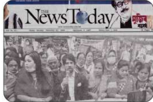
Media Coverage NARI UNNAYAN FORUM's Human Chain